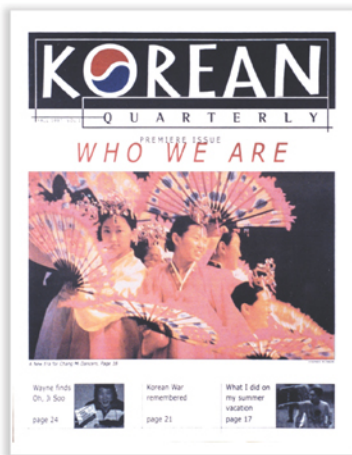
Fall 1997 - First issue